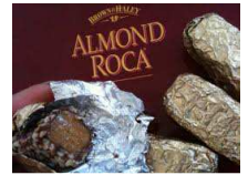
Chocolate with nuts

Whole fruits and vegetable such as apple, peach, and pear should be cut into small pieces and eaten carefully. Carrots should be cooked.