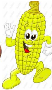
Corn on the cob